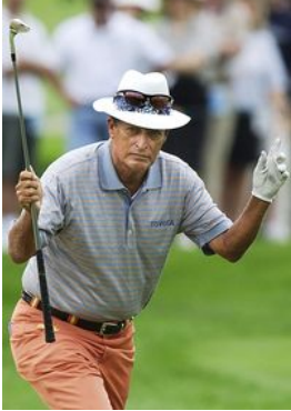
Chi Chi Rodriguez