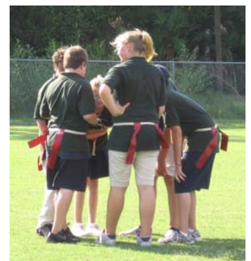
Middle School students huddle during a scrimmage against the Safety Harbor Montessori Academy

Chi Chi Academy After School Program starts Flag Football league: Our Academy First Tee coaches along with the Safety Harbor Montessori Academy, The Largo Montessori and Palm Harbor Montessori Academy have teamed up to start an intramural flag football league. The teams held their first scrimmage near the end of October and plan to expand the league to include several local Academies. The Chi Chi Cheerleaders will also be an addition to the After School Program. This is a valuable addition to schools that have few organized competitive sports opportunities.